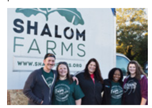
Watch the Farm the City video recap at vacu.org/farmthecity.

The team completed construction of a greenhouse. In addition, they weeded, mulched, built washing and packing stations, painted garden signs, and harvested more than 300 pounds of produce.